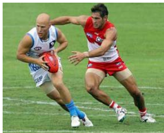
Figure 1: Can Kennedy catch Ablett?

This year, we have reverted to the simpler model we used in 2012 where points are awarded for Kicks, Handballs, Goals and Hitouts. Players on the winning team also gain an advantage that rises as the margin rises. The final two variables are the score percentage and the difference between the Supercoach score and the Dream Team score.